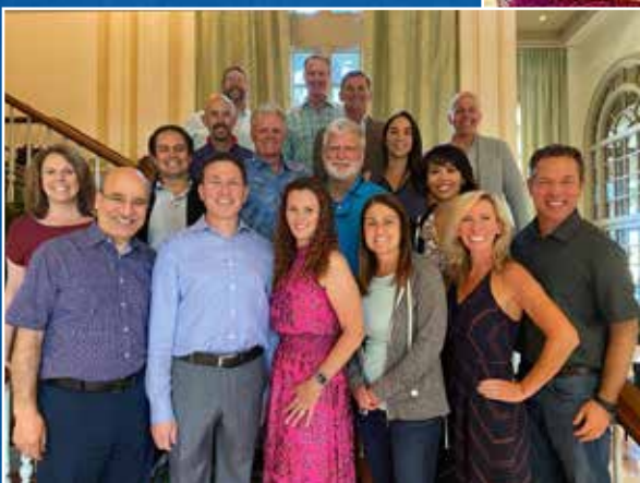
Officer Planning Session Summer Meeting 2021