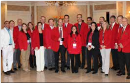
WCDDA's Annual Meeting Red Jacket Hosts