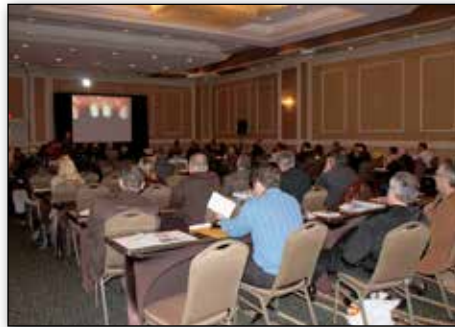
Annual Meeting Lecture