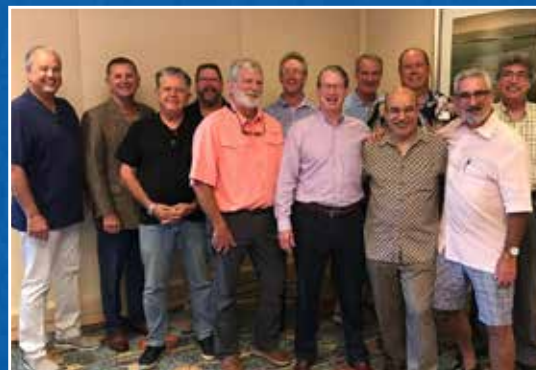
Past President's Breakfast at the 2021 Summer Meeting.