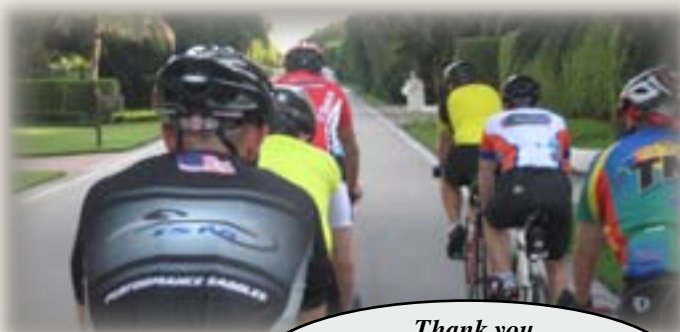
Early morning cycling