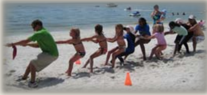
The tug-of-war family fun event.