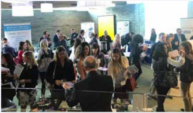
Exhibit hall frenzy!

To view more meeting photos, visit http://wccdaphotoalbums.shutterfly.com/ .