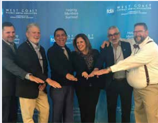
Past President huddle!