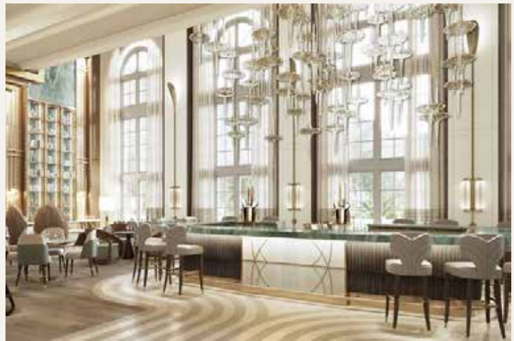
The sophisticated lobby of The Ritz-Carlton, Naples features an ornate Champagne Bar.

A COMPONENT OF THE AMERICAN & FLORIDA DENTAL ASSOCIATIONS