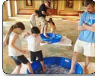
Family Fun Event