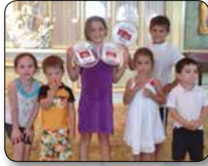
Family Fun Event